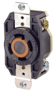
Power Cable (provided)