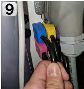
9 Plug-in power cord

No resevoir is included with the system but an empty bleach bottle works well.