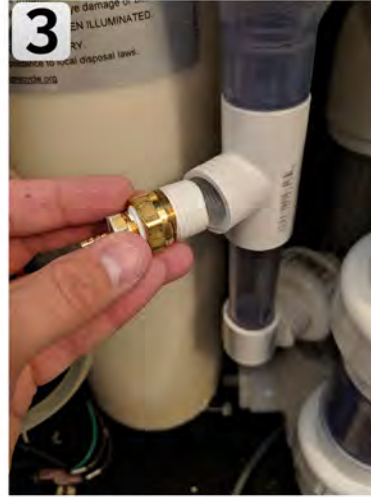
3 Install brass tubing adapter where plug was. (make sure it is teflon taped)