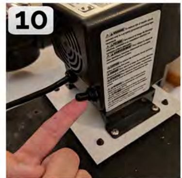
10 Turn on power switch