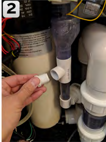
2 Remove plug from ozone injector located in the black ozonator box