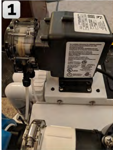
1 Mount pump to the filtration system with existing screws on UV/ozone box