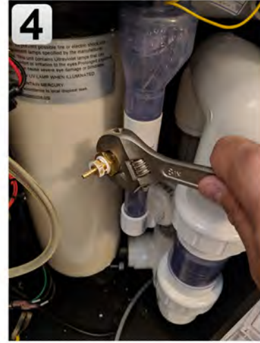
4 Tighten the brass adapter fitting