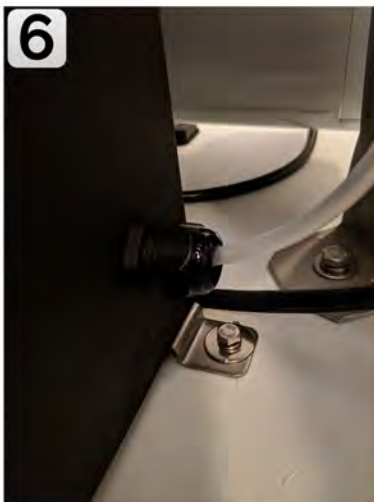
6 Install gland nut for tubing in knock out and run tubing