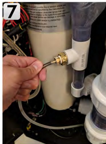
7 Push tubing onto brass barb fitting