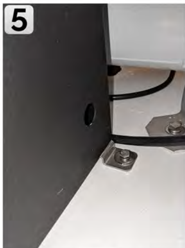
5 Remove the "knock out" from the bottom of the ozonator box